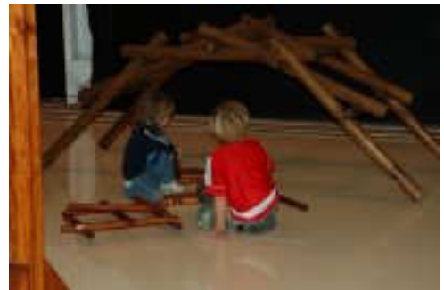
RA_0027 Interactive Portable Bridge