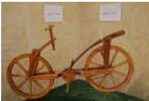
RA_0016 Photo Station