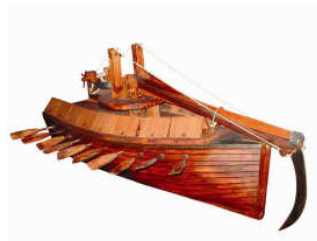
6 Scorpion Battleship