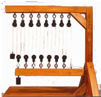
9 Pulleys: Linked