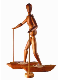
5 Water Shoes