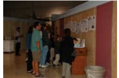
RA_0031 Patrons 2