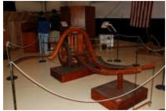
RA_0021 War Wagon