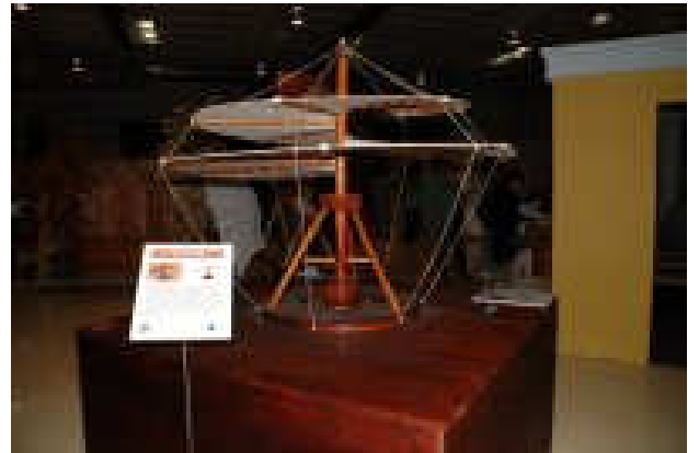
RA_0030 Air Screw