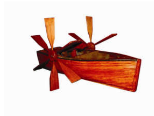
11 Paddle-Wheeled Boat