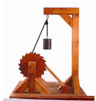
12 Autolock Mechanism