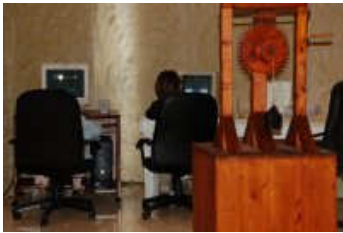
RA_0025 Computer Stations