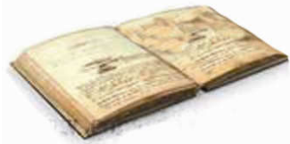
2 Sketch Book