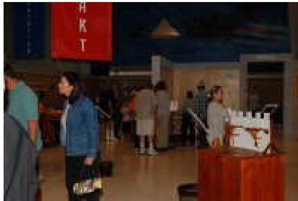
RA_0024 Patrons 1